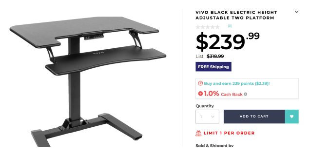
Figure 1: Screenshot of an Office Desk

This paper introduces a new technique of deeply analvzing product information in natural text. The problem of tagging product information regarding multiple attributes has been long studied as a sequence tagging task. The problem draws special attention in E-Commerce applications because tagging attribute information like product brand names is particularly useful when product profile information such as titles and descriptions come in large quantities. Once successfully automated, this task allows various product attributes to be recognized from free-form text saving significant labor of human annotation. The difficulty of this problem primarily comes from stacking of attribute complexity and irregular text format. In early days, simple and rulebased heuristics were used such as regular expression (regex) matching for identifying product brands from titles. But regex matching suffers from low recall as unseen brands never get invited to the pre-defined rules. While naive probabilistic approaches like linear chain conditional random field (CRF) achieves better generalization, they lead to unacceptably low precision. In addition, for official E-Commerce Web sites, there are downstream tasks including item classification, purchase behavior analysis and end-user recommendation, all relying upon accurate product information.