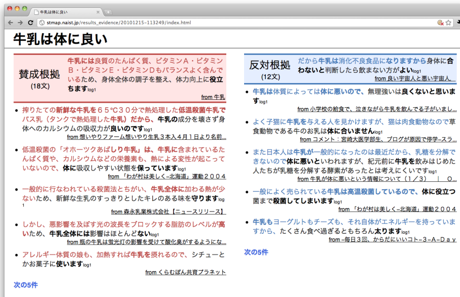
Figure 1: Screenshot of the Evidence Search system

The organization of evidence into groups that support or oppose the user query is a task of viewpoint detection, and it draws on the work of the Multi-Perspective Question Answering of Wiebe et al. [18], as well as later work in online stance recognition [12], and the viewpoint visualization of STATEMENT MAP [9], whose engine we make use of in our prototype system. Our goal here, again, is to supplement this cluster of viewpoints with information on the quantity and quality of evidence supporting each one.